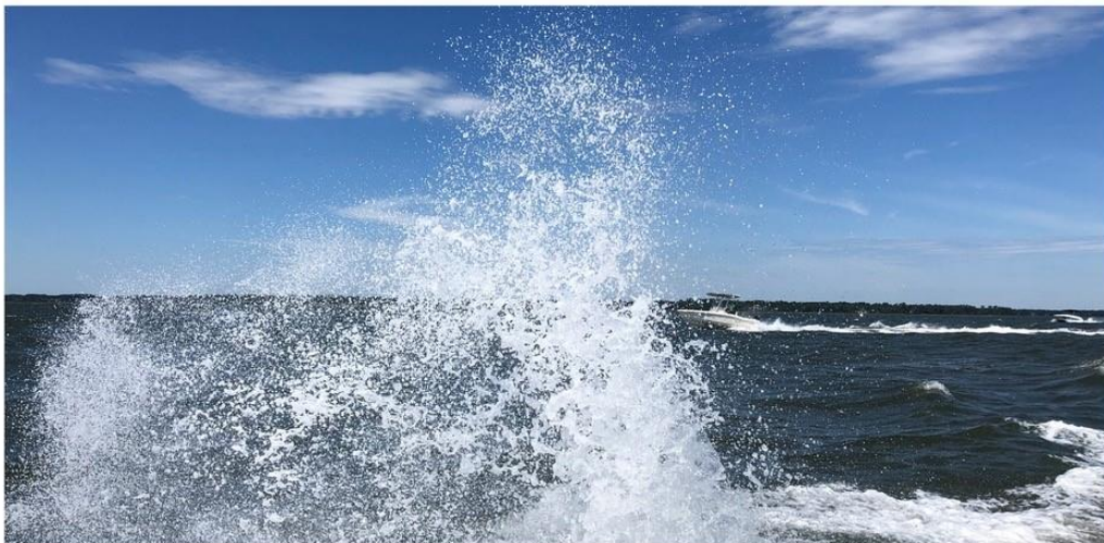
CREATING OPPORTUNITY FOR AREA DENTISTS TO REPLACE LOOSE FILLINGS, our intrepid voyagers bang their way down the Chechessee River on the final leg home.