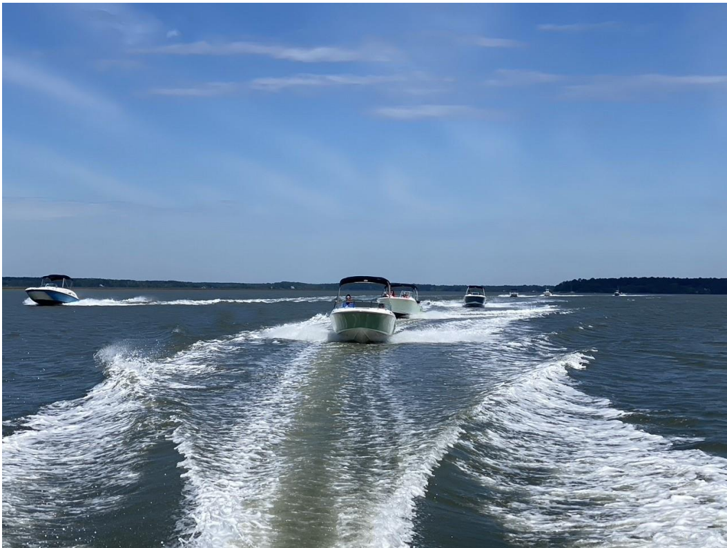
BUOYED WITH ENTHUSIASM over not running aground at the end of the Okatie River, the fleet bursts onto the upper reaches of the Colleton River for the trip home.