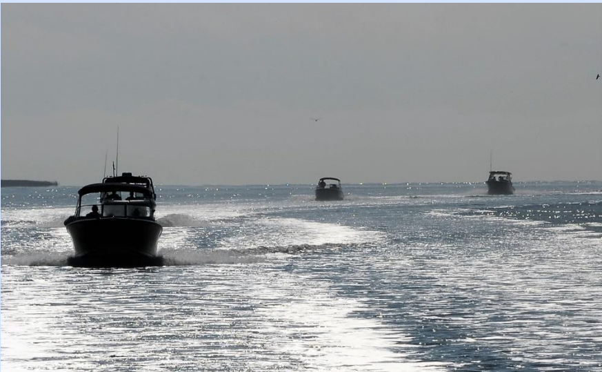
It was a great day to be out on the water!