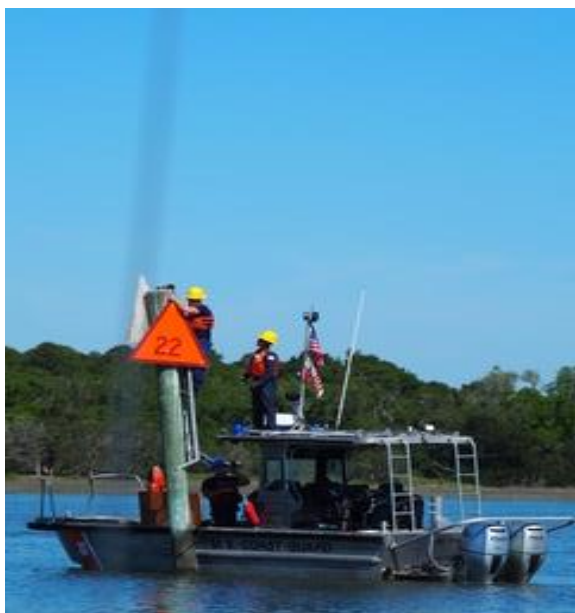
US Coast Guard mending the channel markers.