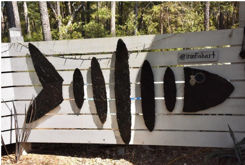
Steel Bone Fish sculptures $1,650 - $4,250