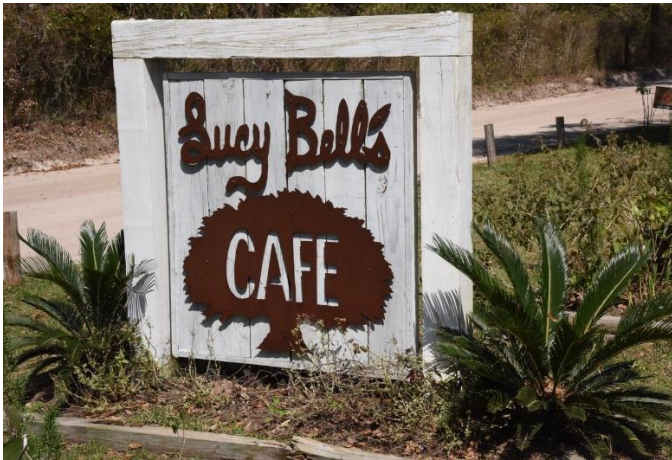
Lucy Bell's is serving lunch.