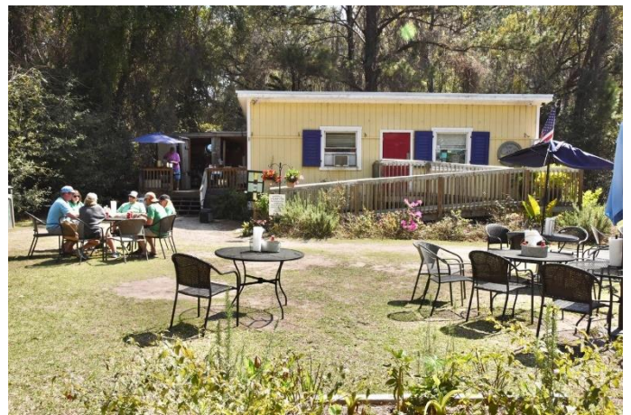
We went inside to order and had lunch outdoors.