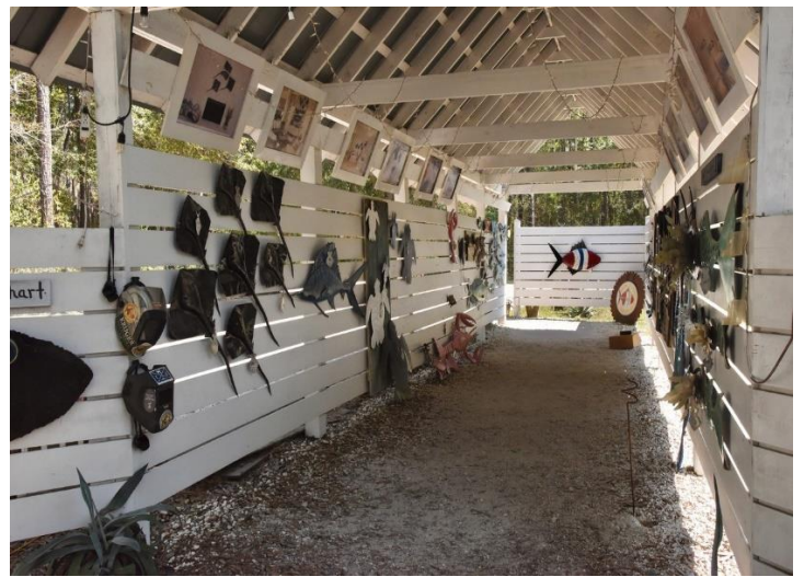
A collection of handmade art at the Iron Fish