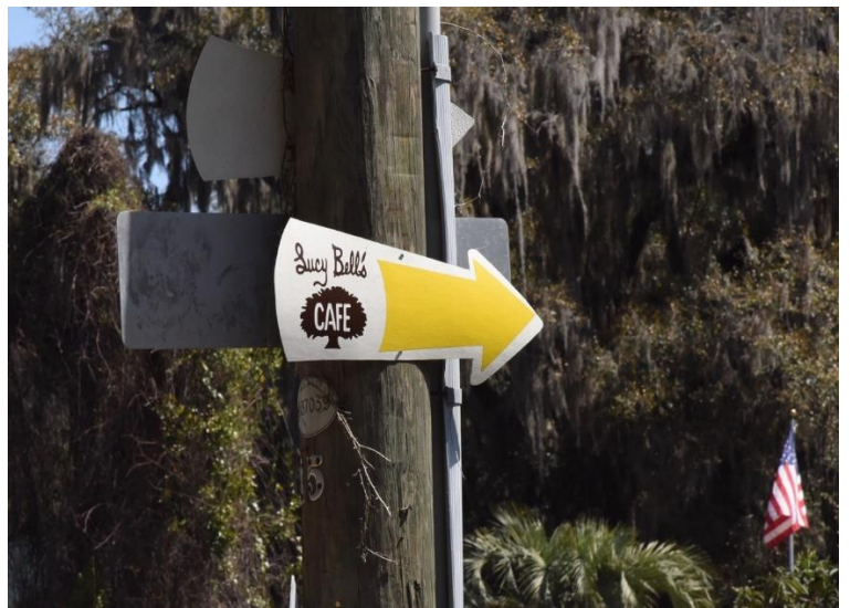
Hmmmm...is this a 'sign' to our destination?