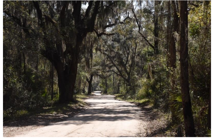
The after-lunch mystery walk...