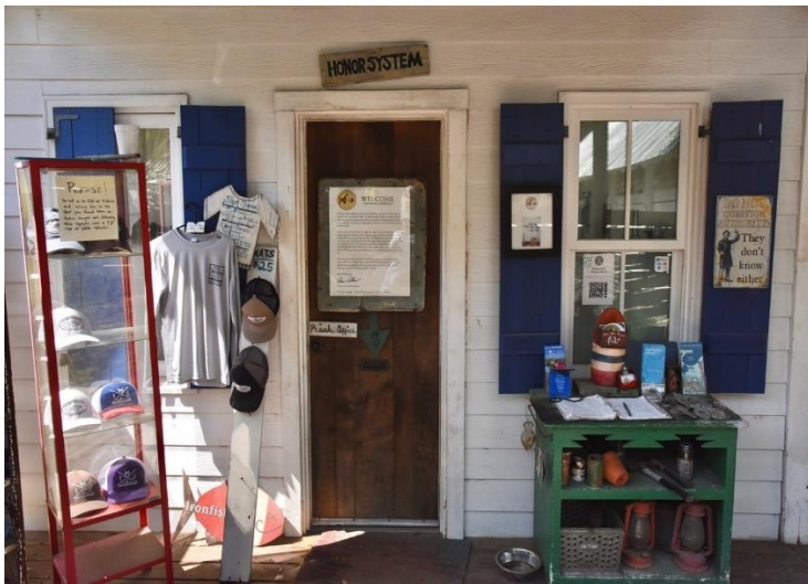
Note the "honor system" payment plan above the door at the Iron Fish.