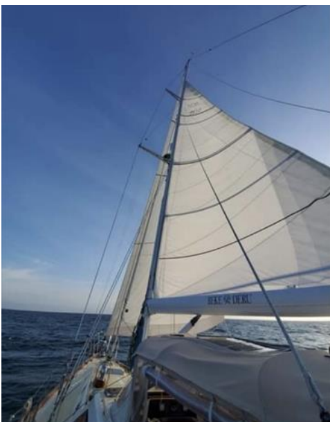
June 10....sailing NE ready to come about and point to Charleston.