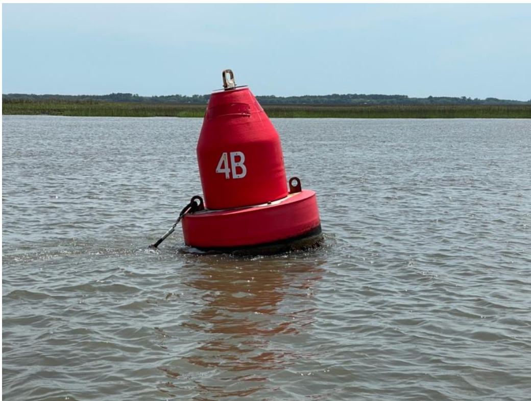
Sea buoy that a dredging company is temporarily storing on the river.