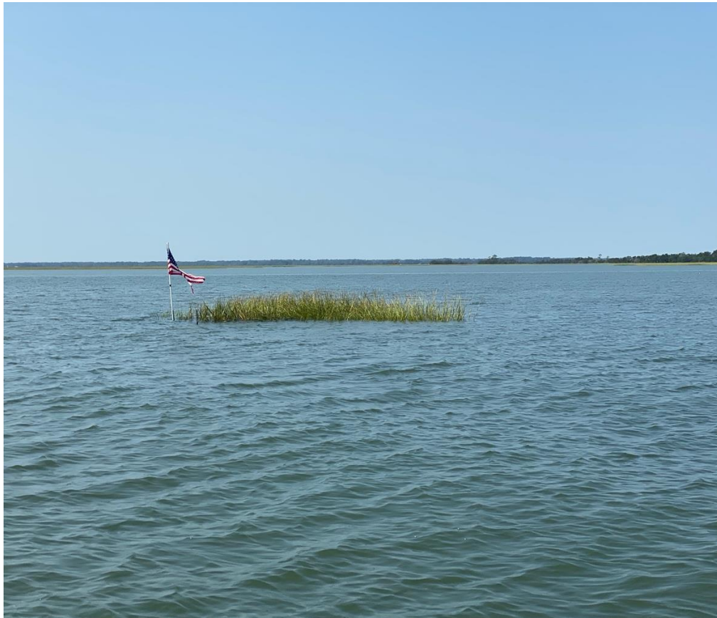
Island on the Story River where Commander Dion planted the flag claiming the land for ABCHH as the site of our future world headquarters