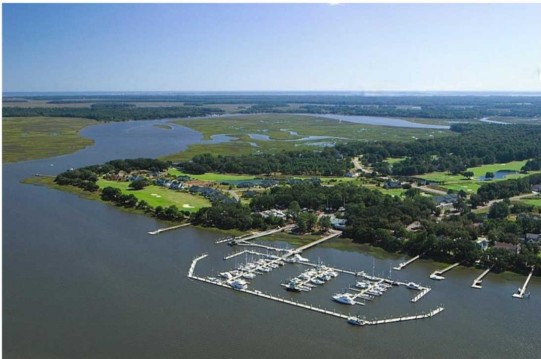
Dataw Island Marina (pre Hurricane Matthew)