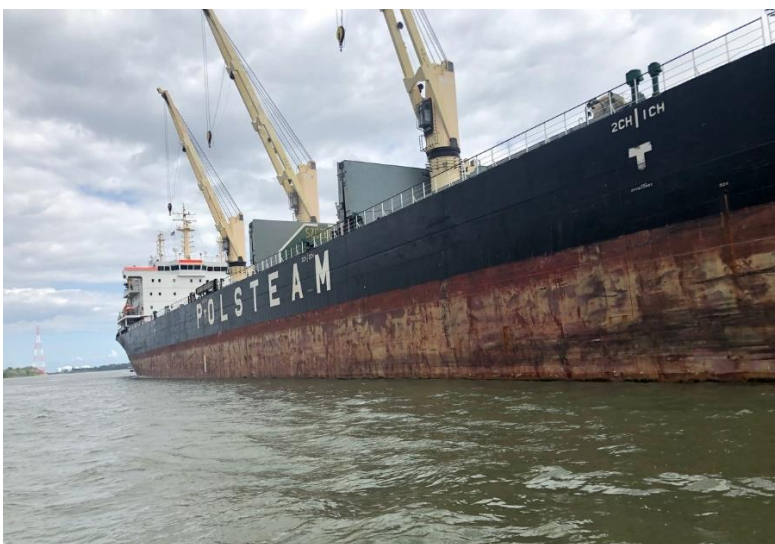
"Not going to argue Right-of-Way with this guy."