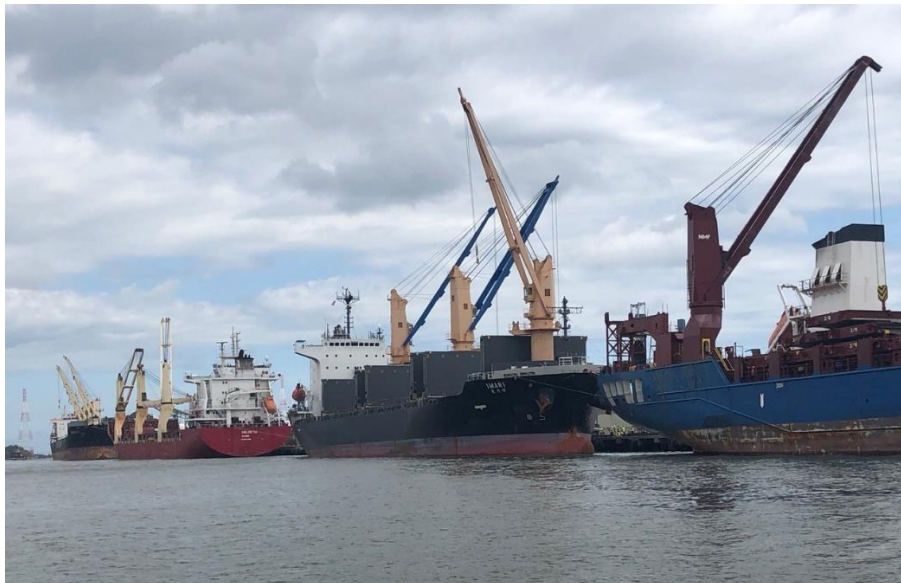
Typical scene at the Port of Savannah with ships lined up like moms in their SUV's waiting to pick the kids up from school.