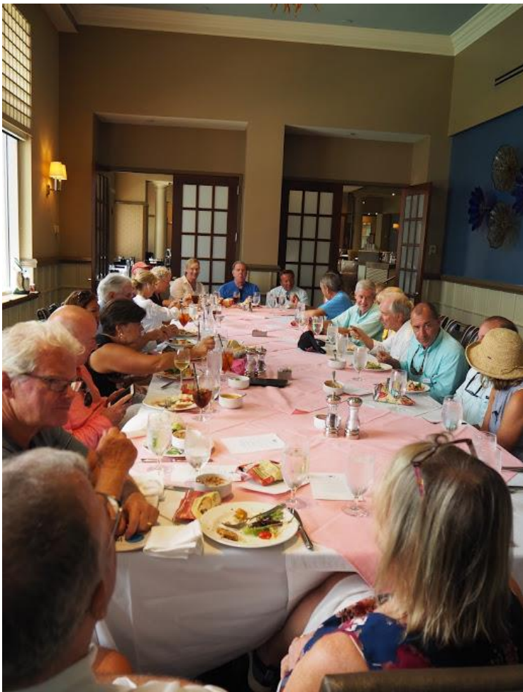
The lunch bunch at the Aqua Star in the Westin Hotel.