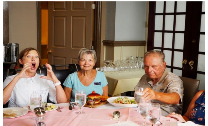
Can anyone guess who that is next to the Kozyr's?